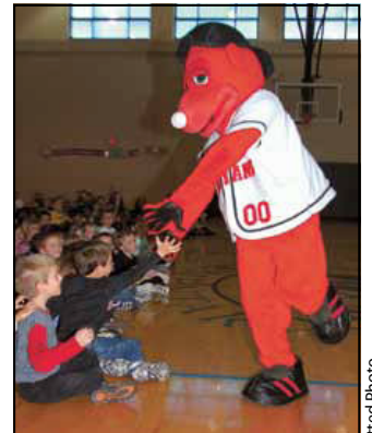
Rowdie with Oak Trace students

"They (the Indians) contacted us to write the show and we enjoy doing